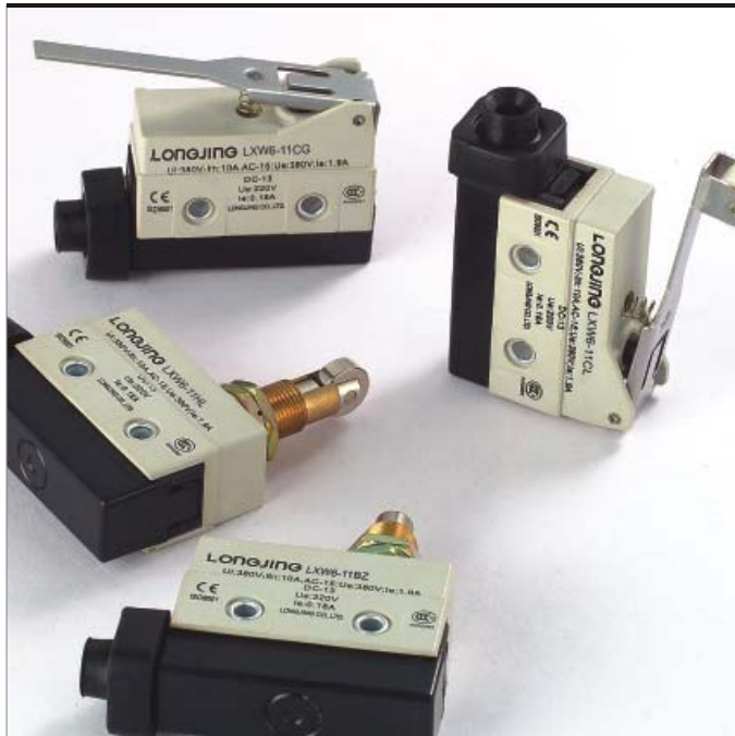
接触形式 Contact Type